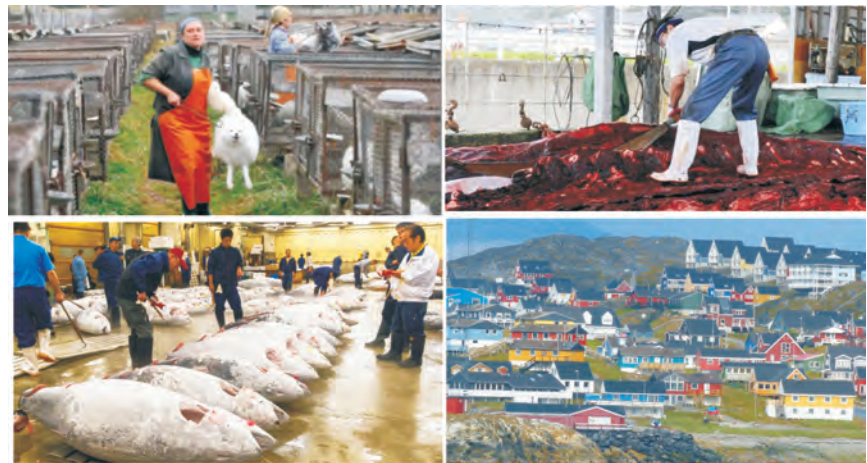
Nuuk - Capital of Greenland

Fur farms have been established to breed animals. Good roads and a fine network of communication have been developed. Many small towns have been built in coastal areas. Nuuk is the biggest town. It is major centre for fish processing. Fish is canned and exported to other countries.