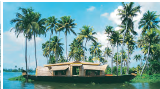
A Backwater in Kerala