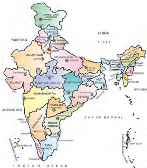
Map of India and its Neighbouring Countries