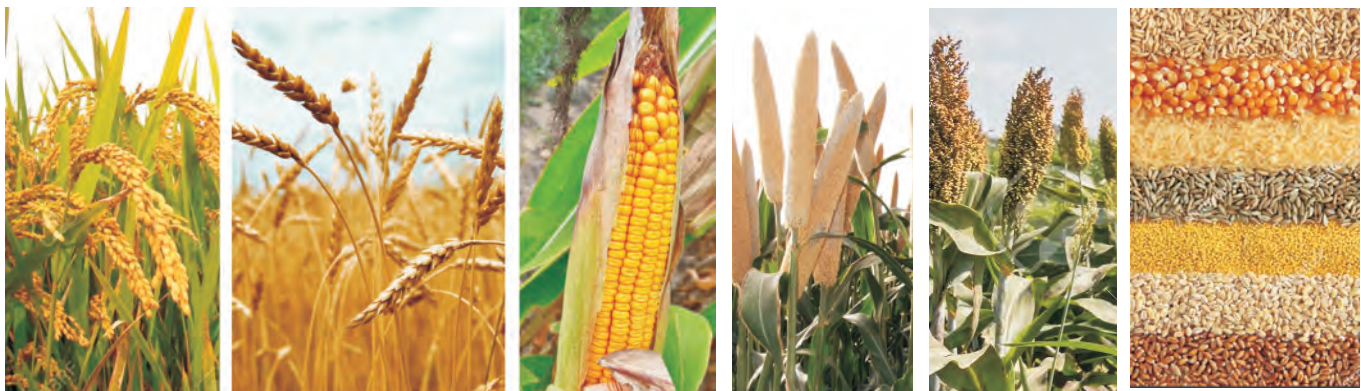
Some types of food grains

Our country is very large with different physical features. The climate varies from one place to another. People of different religions live here. They have different cultures, different lifestyles and different food habits . Different kinds of crops are grown on different places.