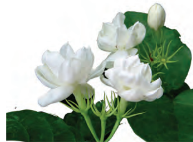
◆ Jasmine plant