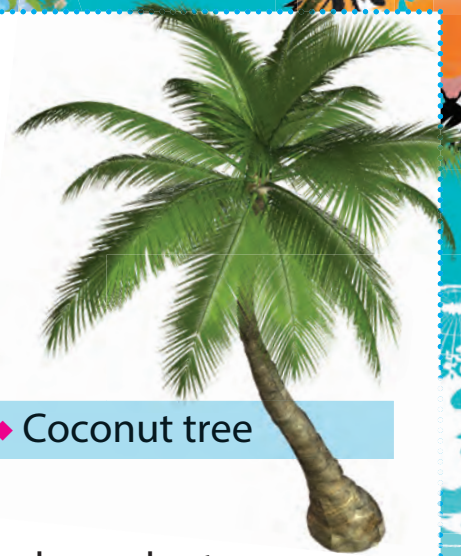
◆ Coconut tree