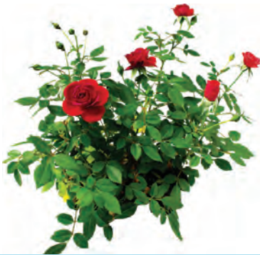
◆ Rose plant

Shrubs are smaller than trees. They have a hard and woody stem. Most of them live for a few years.