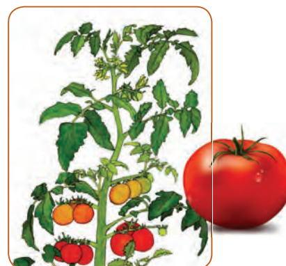
◆ Tomato plant