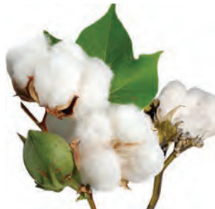
◆ Cotton plant