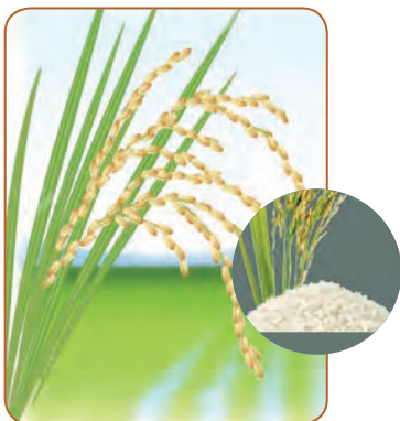
◆ Rice plant

The very small and seasonal plants are called herbs. They are smaller than shrubs. Their stems are thin and soft. Most herbs live only for a few months.