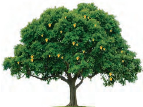
◆ Mango tree