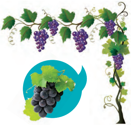
◆ Grapevine plant

Some herbs have weak stems. They cannot stand on their own. They need support to grow upwards. Such plants are called climbers.