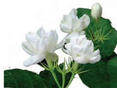
◆ Jasmine plant