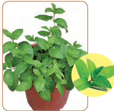
◆ Mint plant