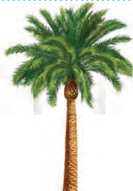
◆ Palm tree