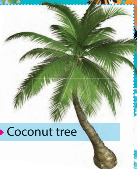
◆ Coconut tree