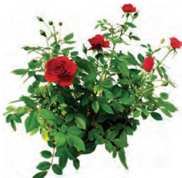
◆ Rose plant

Shrubs are smaller than trees. They have a hard and woody stem. Most of them live for a few years.