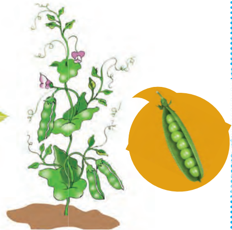
◆ Pea plant