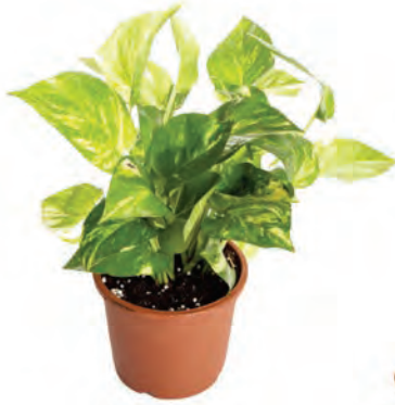
◆ Money plant