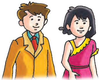
At school/in a party

We wear different clothes at different places. When do we wear these clothes? Tick (✓) the right answer.