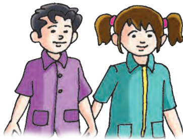
In a party/at night time