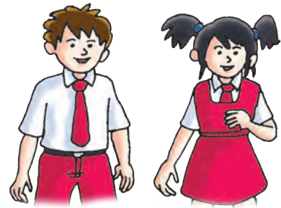
At school/in a party

We wear clothes to cover our body. Clothes protect us from heat, cold, rain and dust. Neat and well ironed clothes make us smart.