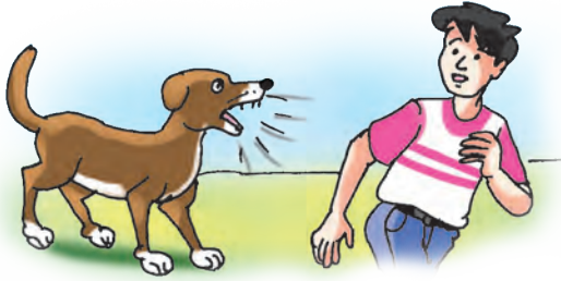
A dog barks when it sees a stranger.

Do you think animals also communicate? Yes, they also communicate by making gestures and sounds.