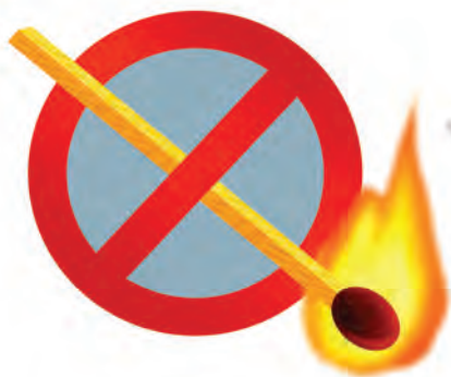
▲ Careful with fire