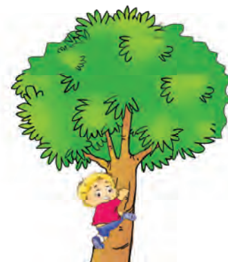
▲ Do not climb trees