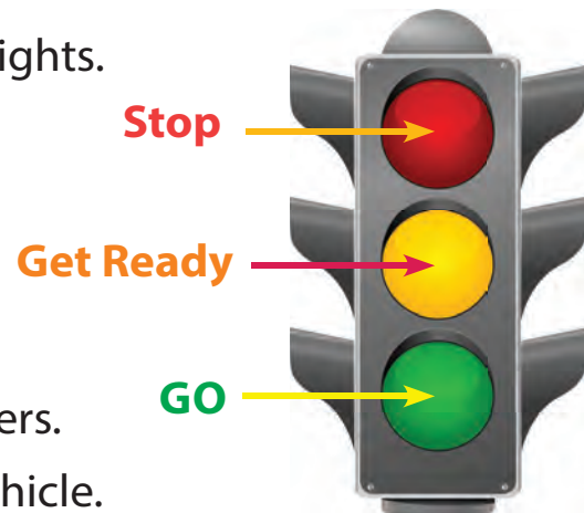
▲ Traffic lights

Do not chase a kite, a ball or a running vehicle.