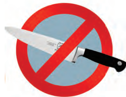
▲ Careful with sharp objects