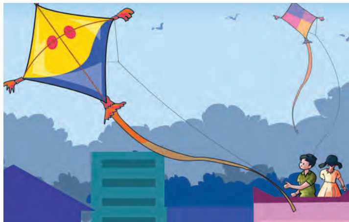
▲ Careful with kites