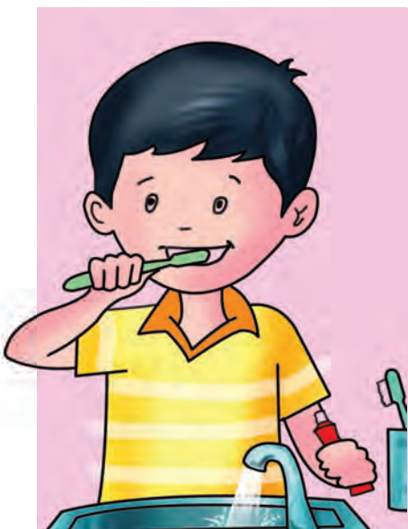
▲ Brush your teeth