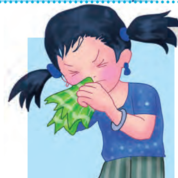
▲ Use handkerchief