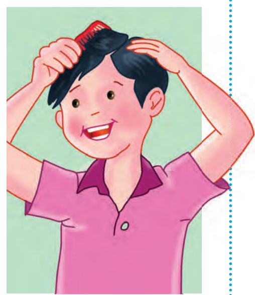
▲ Comb your hair