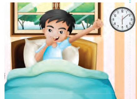
▲ Wake up early