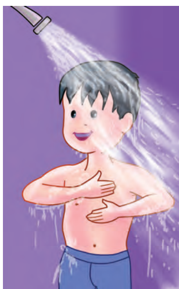
▲ Take a bath