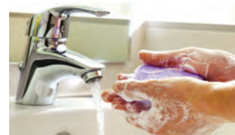
▲ Wash Hands